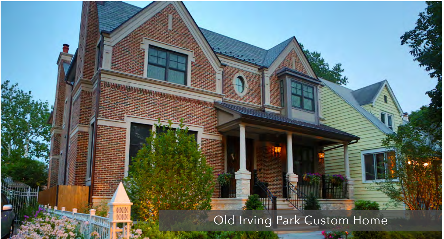
Old Irving Park Custom Home