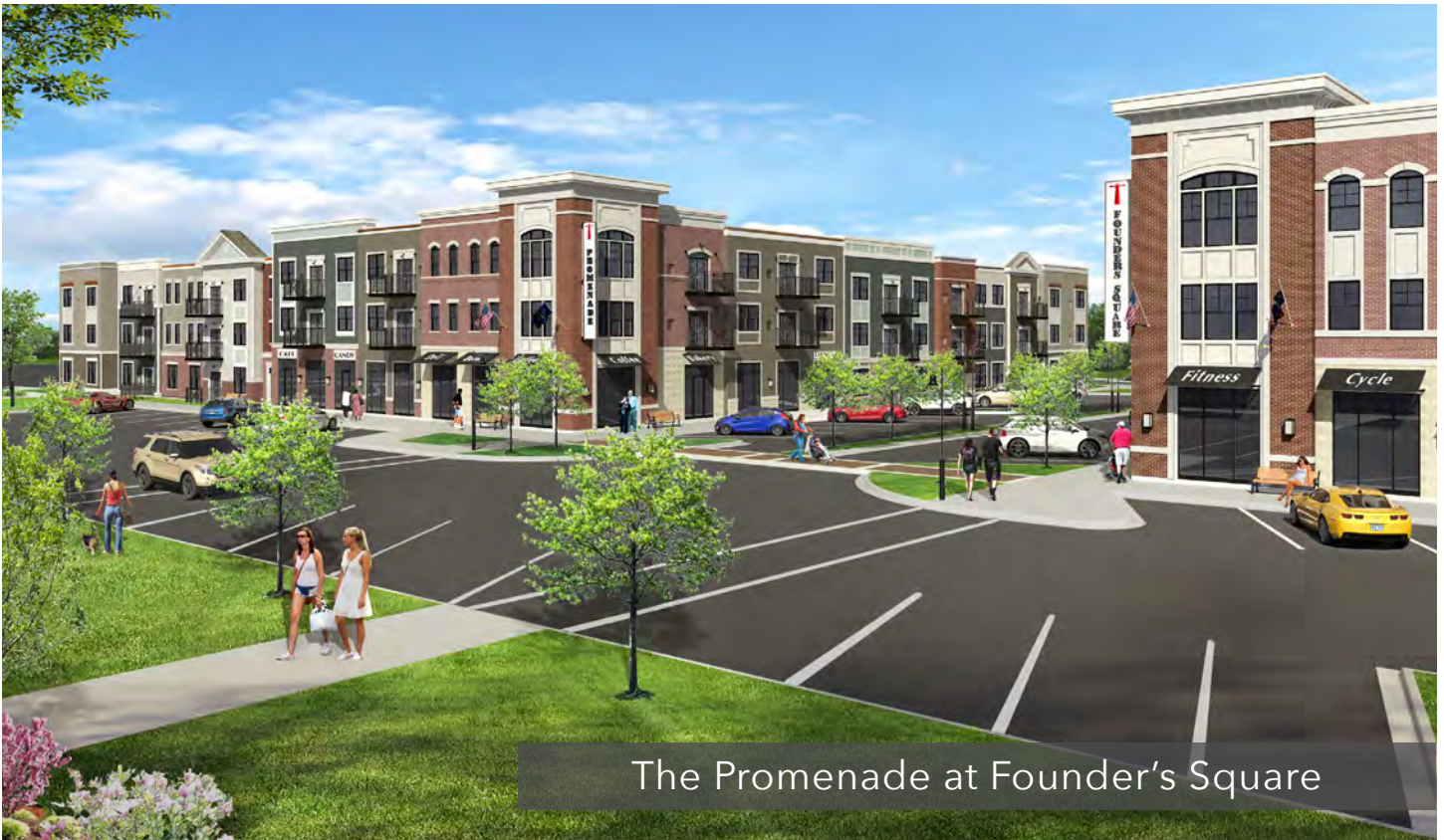
The Promenade at Founder's Square