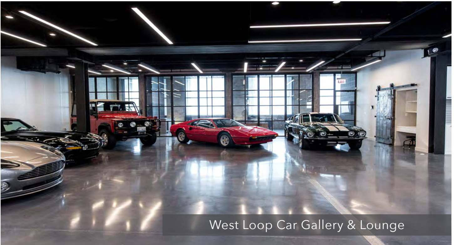
West Loop Car Gallery & Lounge