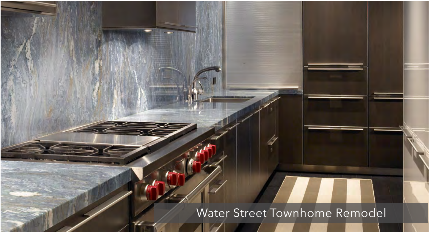
Water Street Townhome Remodel